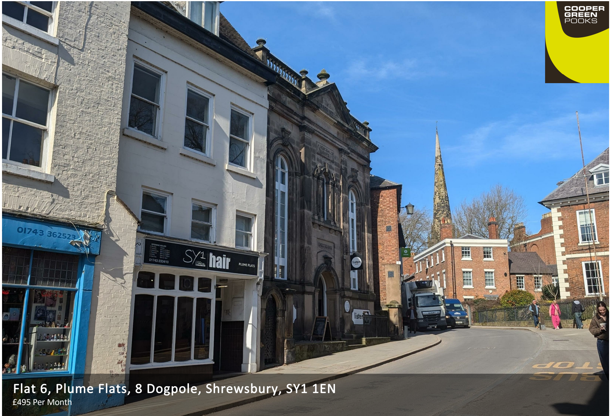
Flat 6, Plume Flats, 8 Dogpole, Shrewsbury, SY1 1EN £495 Per Month