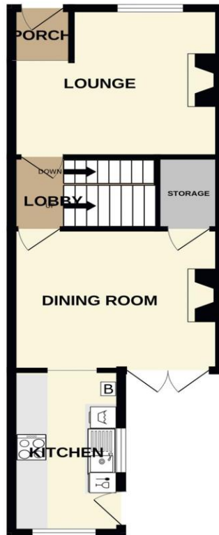
GROUND FLOOR 663 sq.ft. (61.6 sq.m.) approx.