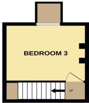
BASEMENT 166 sq.ft. (15.5 sq.m.) approx.