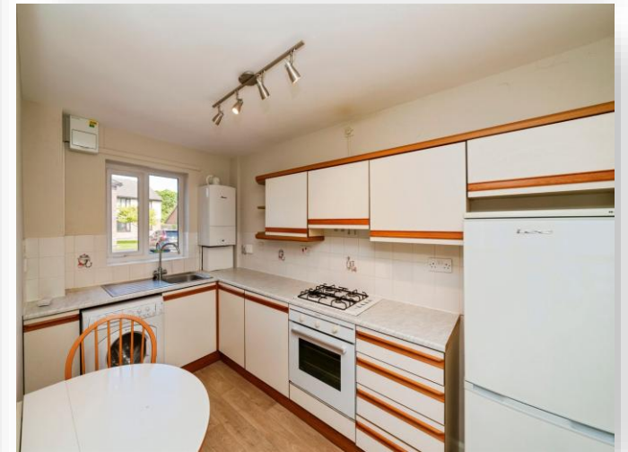
Millcroft Park Frankby Road, Wirral, CH49 3PE