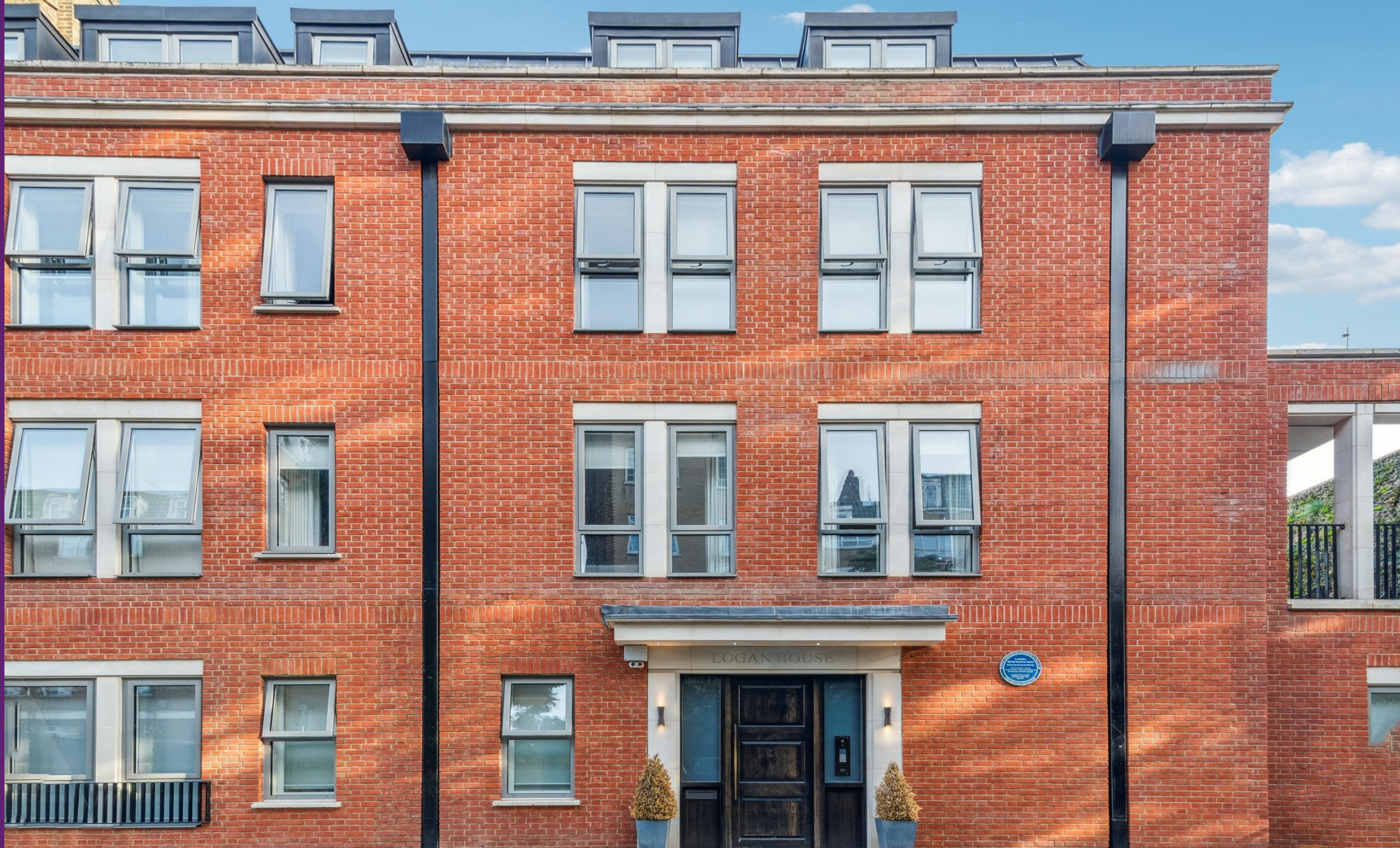
Logan House 1 Logan Place, W8