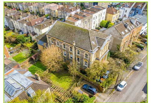
The Old Chapel 14 Fair View Drive, Redland, Bristol, BS6 6PH