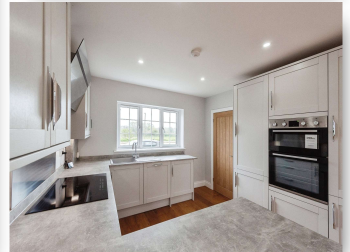
Blackberry Cottage, Lower Street, Baylham, Ipswich, IP6 8JP