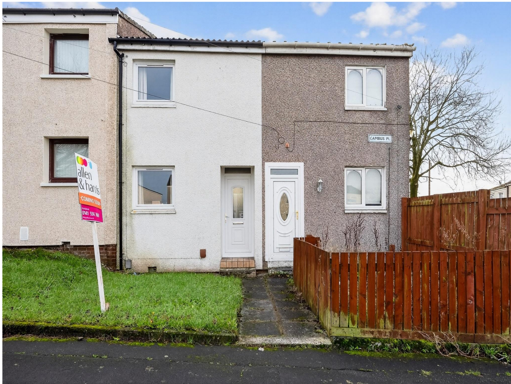
Cambus Place, Glasgow G33 5QH