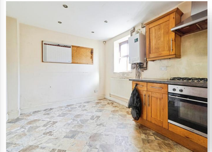
Back Lane, Heaton Bradford BD9 4BX