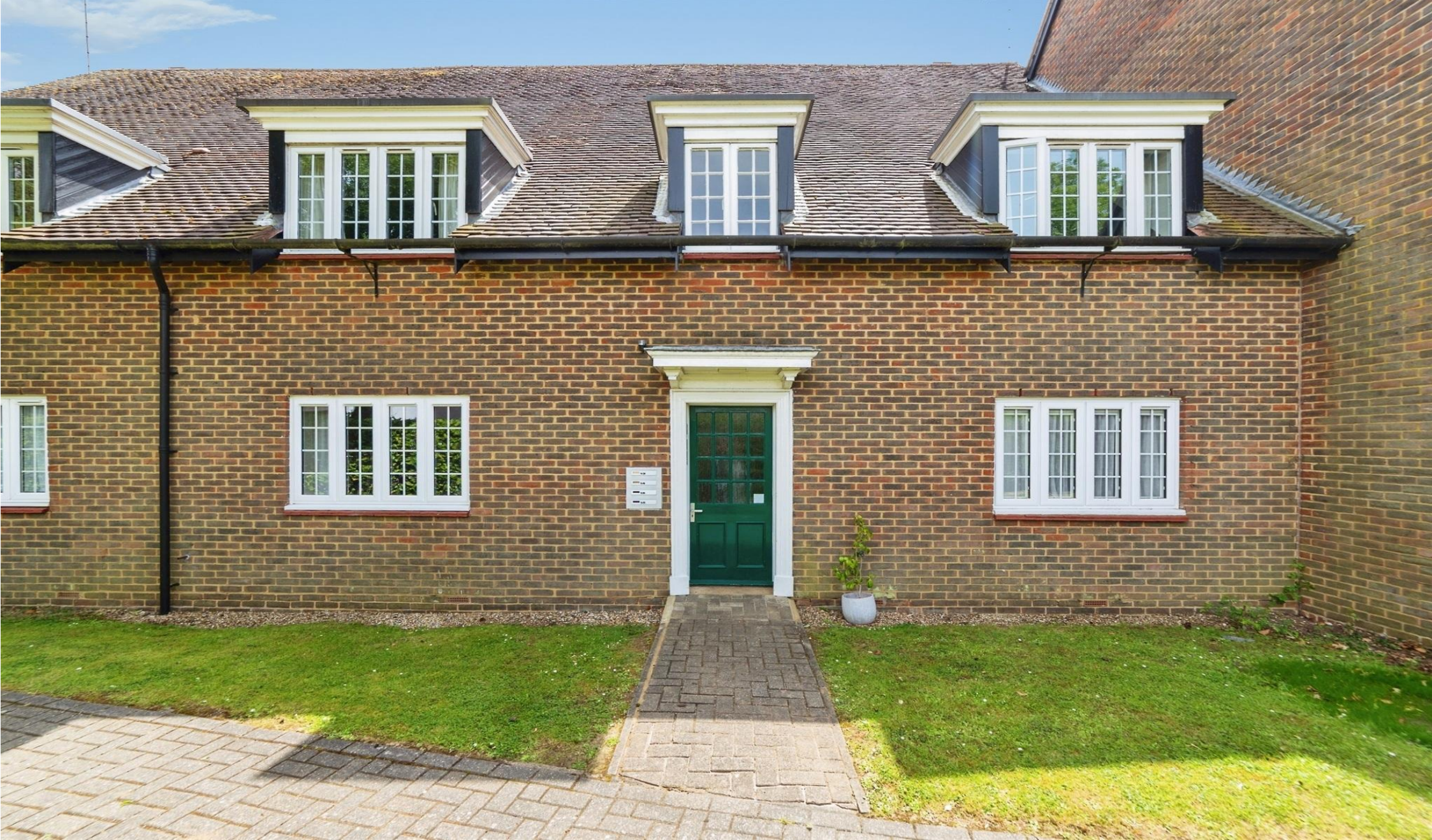
Barnside Court, WELWYN GARDEN CITY AL8 6TL