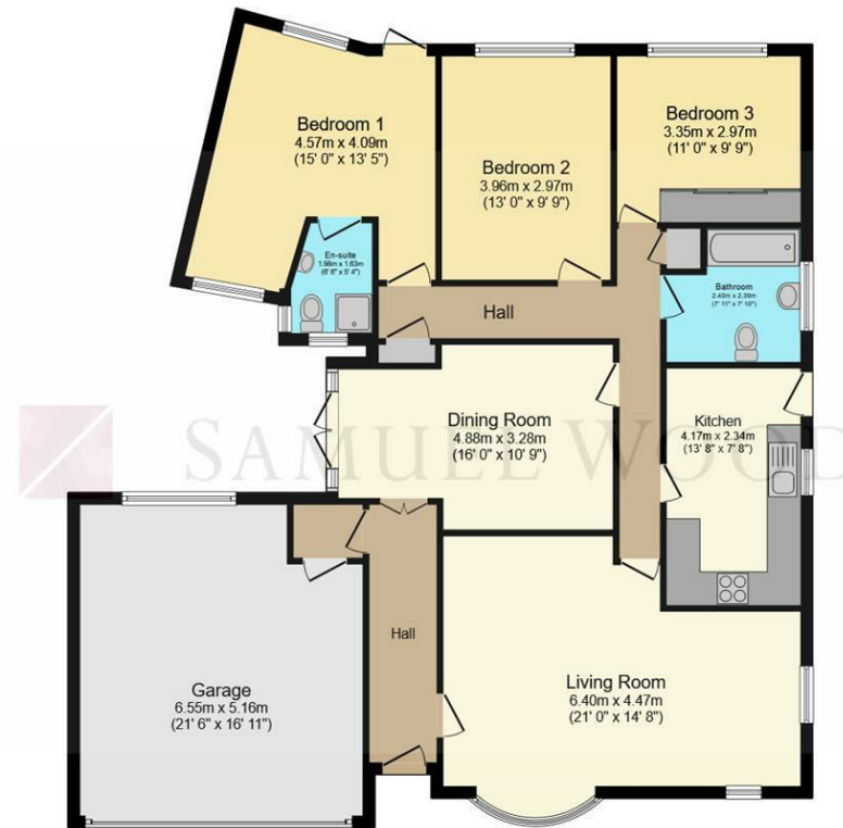
Ground Floor Floor area 143.9 sq.m. (1,549 sq.ft.)

Total floor area: 143.9 sq.m. (1,549 sq.ft.)