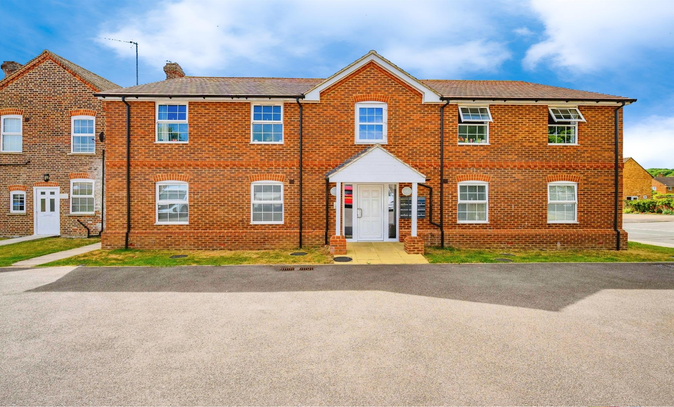
Marnham House Long Chaulden, Hemel Hempstead HP1 2NU