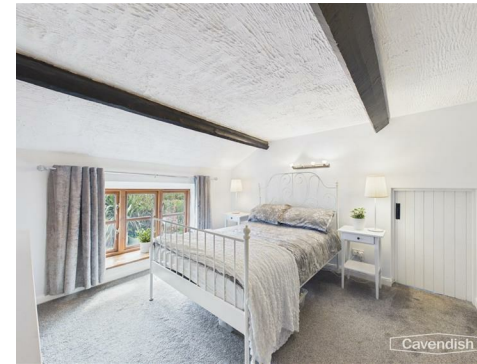
Master Bedroom 3.69 x 3.31 (12'1" x 10'10")

Spacious room with partially vaulted ceiling and exposed beams. Two built-in double-door wardrobes, panel radiator, TV aerial point, and wooden window perfect for a reading spot. Door leads to a walk-in closet with Velux window, wall-hung boiler, light, and power installed.