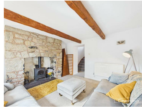
Morning Room 3.61 x 3.33 (11'10" x 10'11")

Window to the front elevation, panel radiator, and a focal log burner. Oak beams and double-glazed window with deep pine sill, exposed ceiling beams, and a raised slate hearth. Feature stone chimney breast with arched recess adds character and charm.