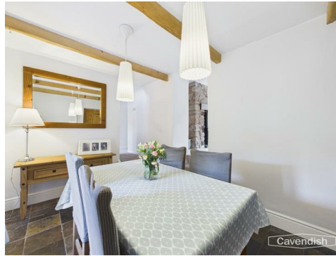
Dining Room 2.57 x 3.69 (8'5" x 12'1")

A characterful space with exposed oak beams and African slate floors that continue into the kitchen and breakfast area. High ceilings, feature wooden windows with deep pine sills, panel radiators. The dining room flows gracefully into the living room via a set of steps, creating a warm and inviting entertaining space.