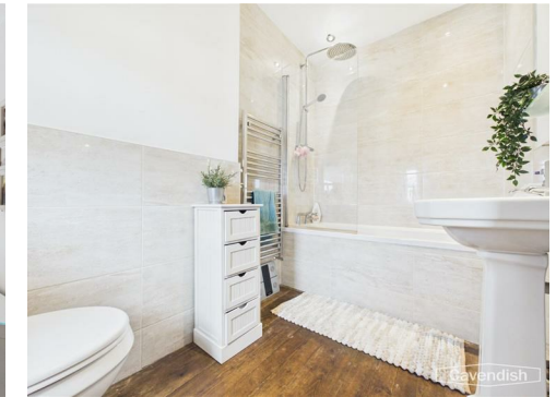
Bathroom 2.76 x 1.57 (9'0" x 5'1")

Newly renovated with wooden floors, tiled walls, ladder-style radiator, waterfall shower, wall-hung basin with storage underneath, and low-level WC. Wooden window to rear elevation provides natural light