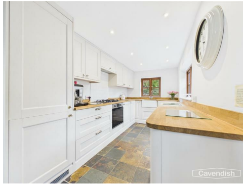
Kitchen 3.84 x 2.13 (12'7" x 6'11")

A light-filled Howdens kitchen featuring an array of wall and base units with solid wooden worktops and complementary tiled splashbacks. There is an integrated dishwasher and fridge freezer, under-counter oven with full extractor fan, five-ring gas hob, Belfast sink, and space with plumbing for a washing machine.