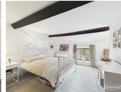
Bedroom Two 3.67 x 3.35 (12'0" x 10'11")

Partially vaulted ceiling with exposed beams, built-in double-door wardrobe and fitted cabinet. Panel radiator, TV aerial point, and tall double-glazed windows to the front elevation overlooking garden, offering garden views.