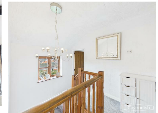
Landing 0.82 x 4.27 (2'8" x 14'0")

Wooden window to the rear with countryside views, turning staircase, doors to all rooms, panel radiator, and loft access.