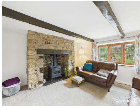
Living Room 3.62 x 3.30 (11'10" x 10'9")

This attractive reception room features a feature stone chimney breast with oak lintel, a gas log burner, and exposed ceiling beams. Wooden double-glazed windows to the front elevation fill the space with natural light. The room radiates character and offers a welcoming setting for relaxed living or entertaining.