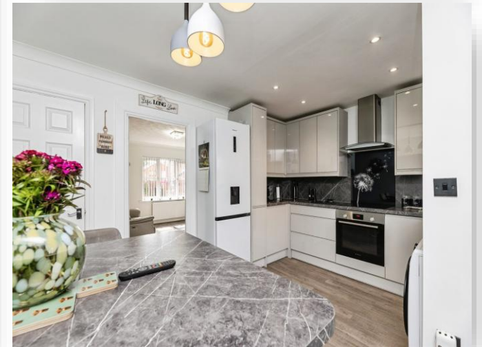
Salisbury Mews, Tingley WAKEFIELD WF3 1WA