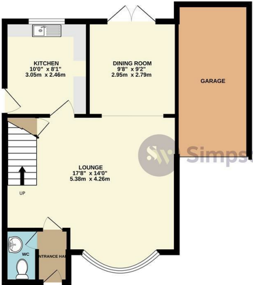
GROUND FLOOR 579 sq.ft. (53.8 sq.m.) approx.