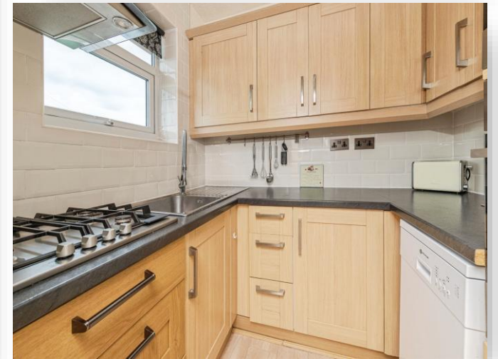
Leyfield Bank, Holmfirth HD9 1XU