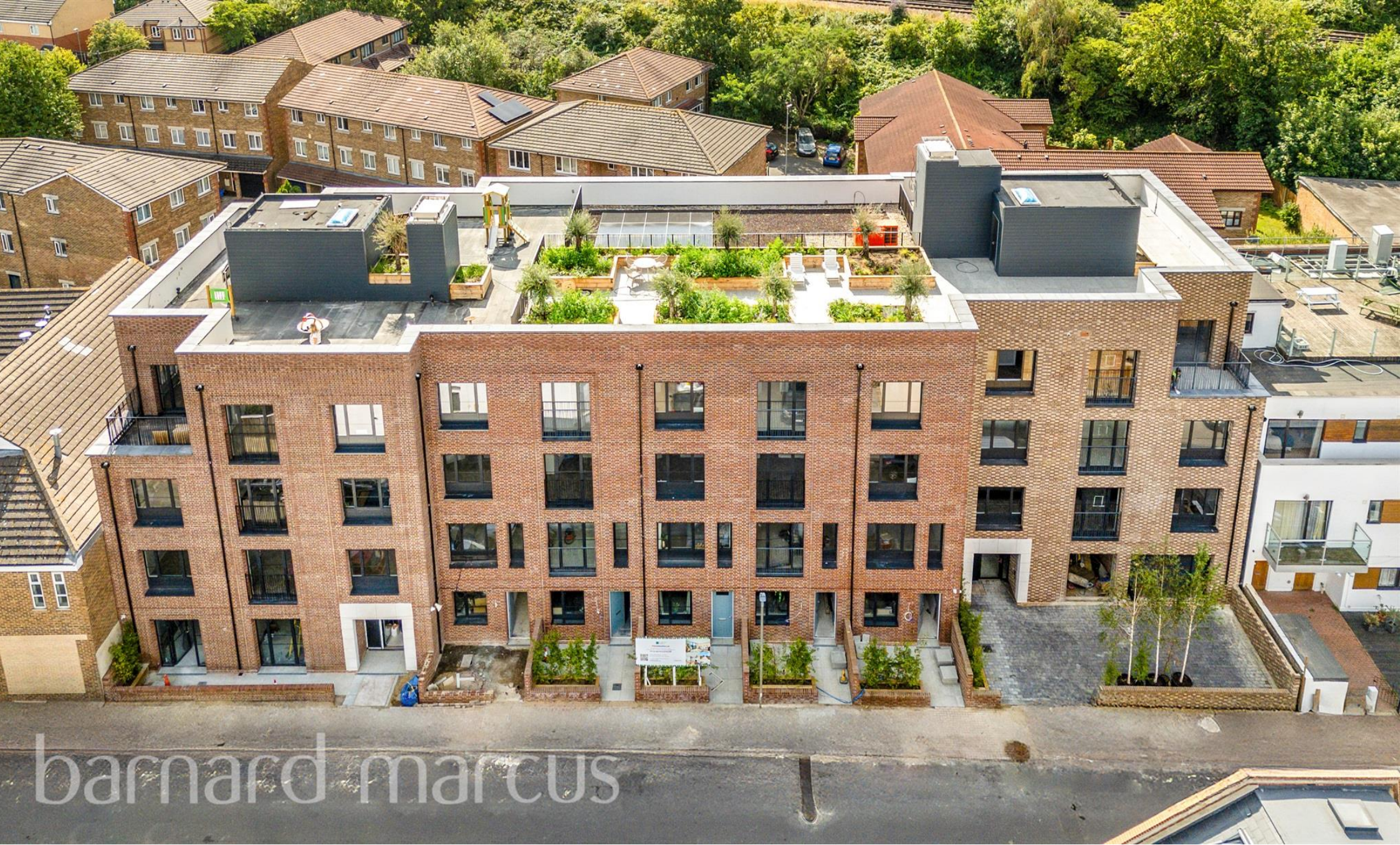
Meadow House Fallsbrook Road, London SW16 6DY