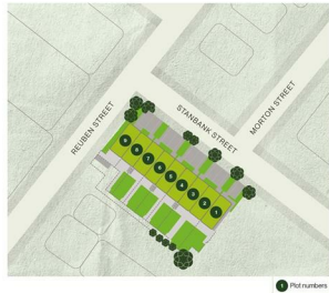
SITEMAP Empress Court