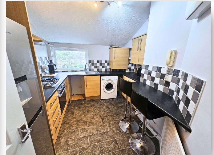
Arundel Green, Aylesbury HP20 2BL