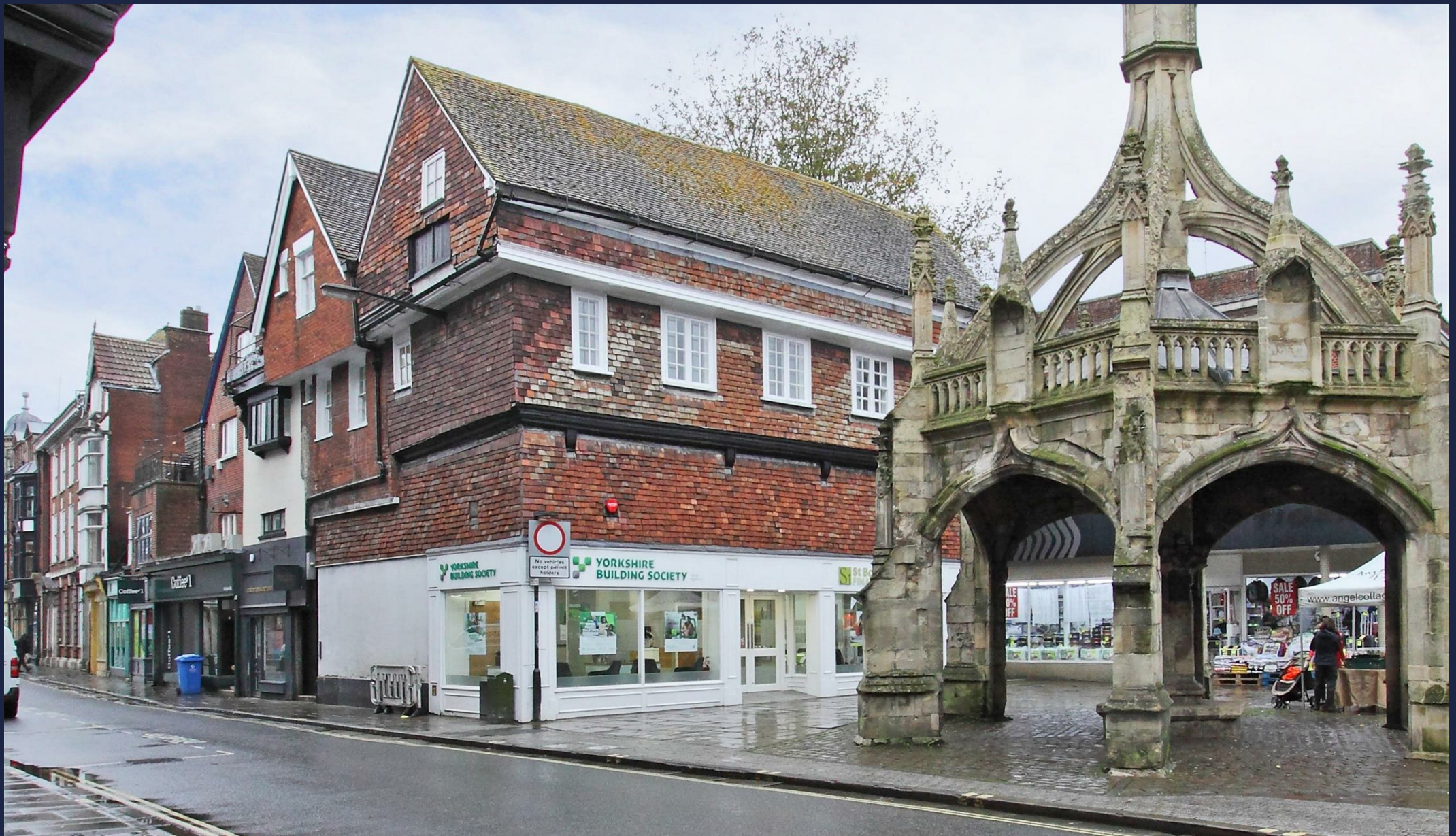
Flat 1, 2 Minster Street, Salisbury