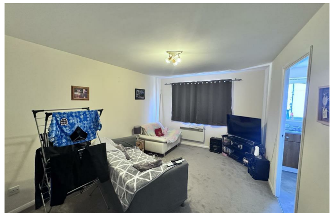
Ascot Court, Aldershot