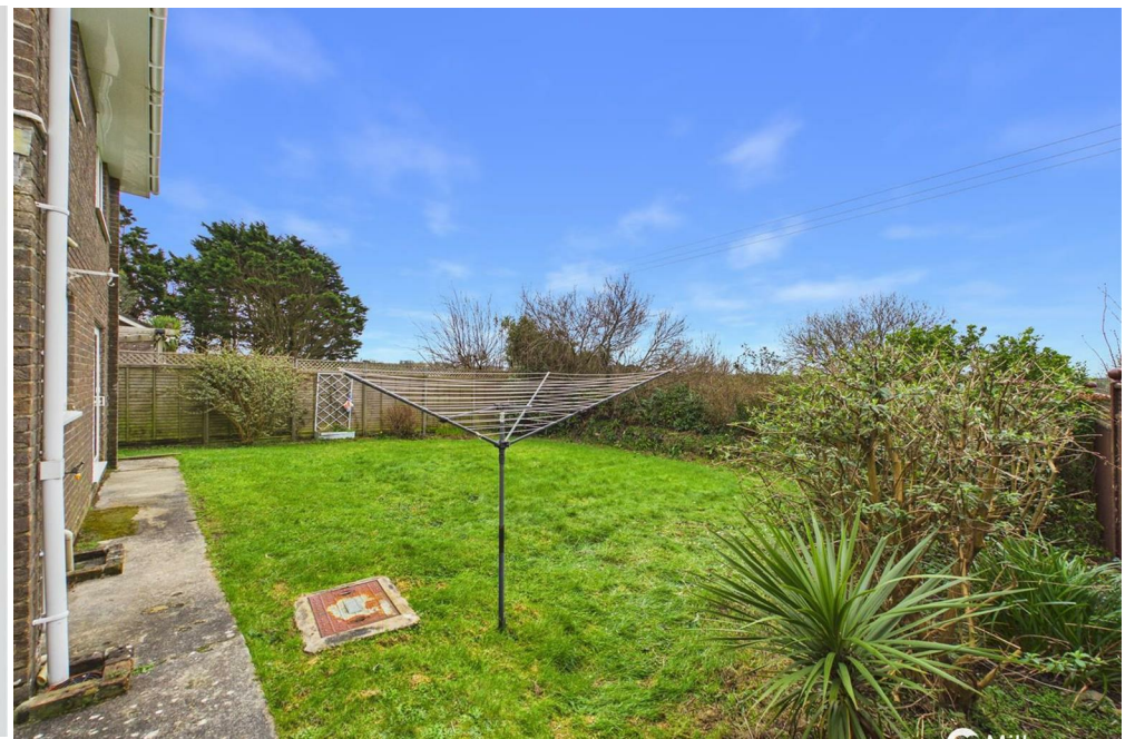
Tehidy Gardens, South Tehidy, Camborne, TR14 0ET