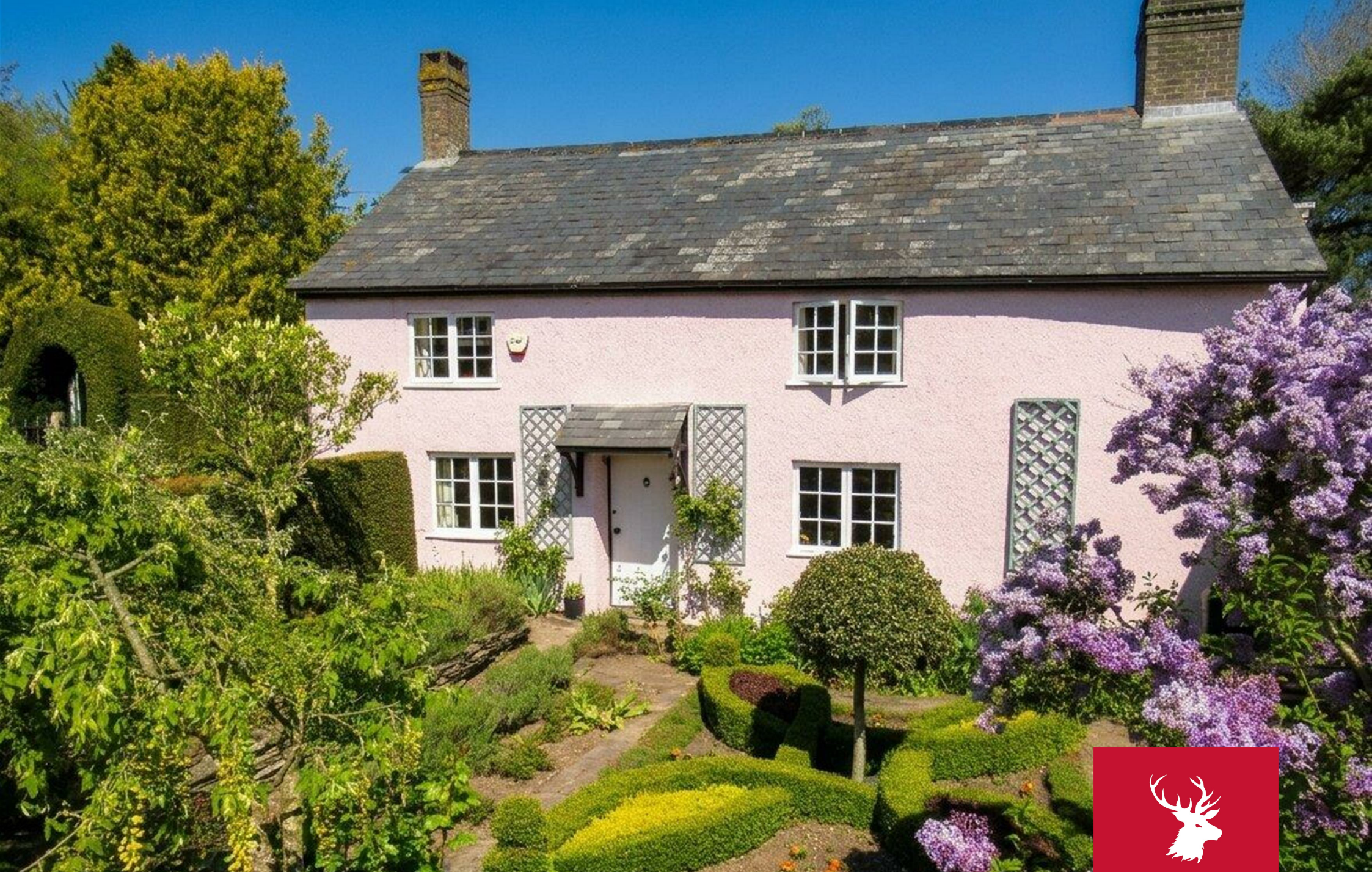
Rose Cottage, Appley