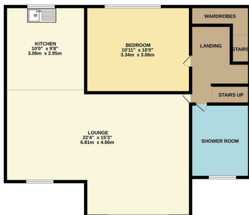
1ST FLOOR 314 sq.ft. (29.2 sq.m.) approx.