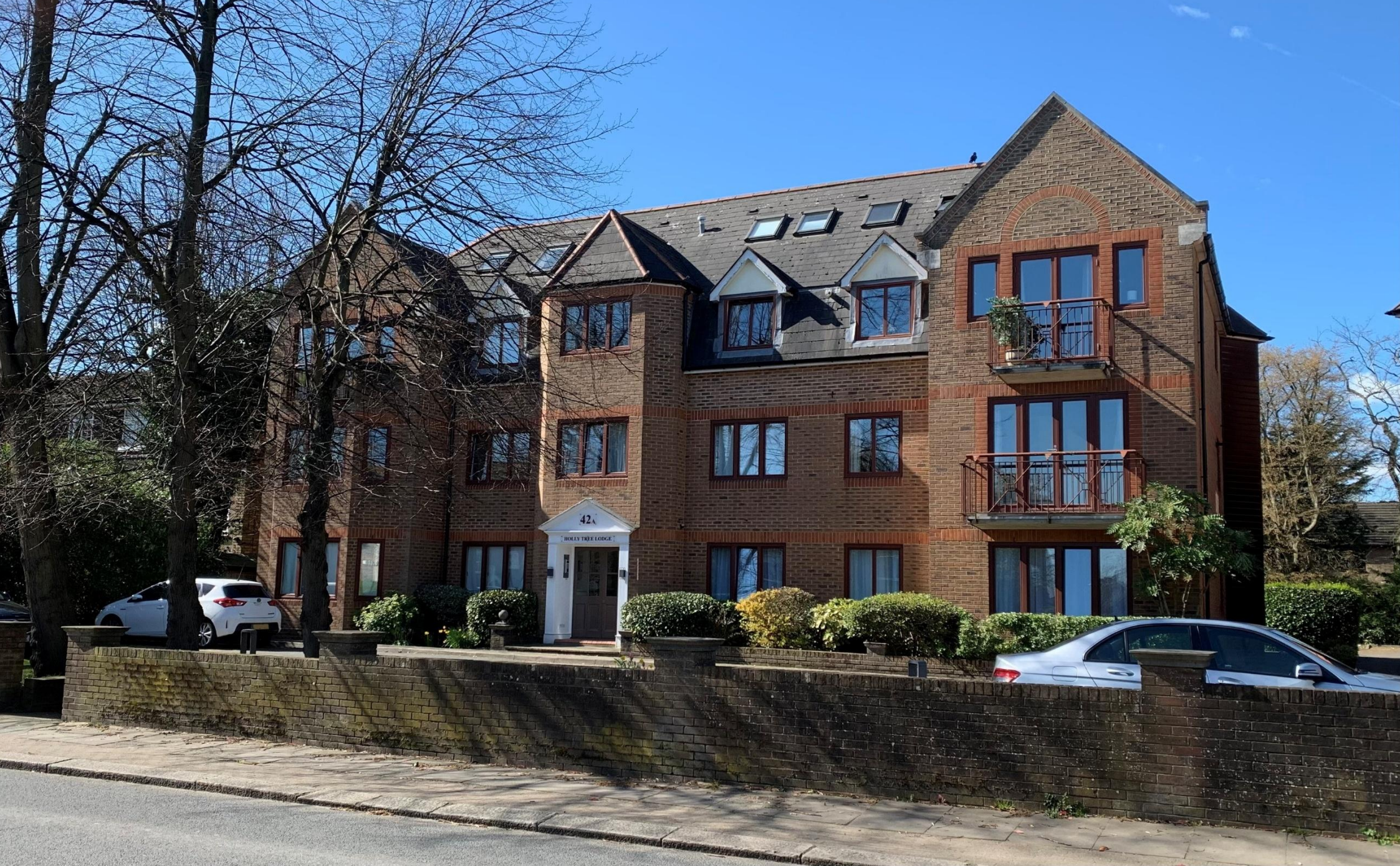
Holly Tree Lodge, The Ridgeway, Enfield, EN2 8QT