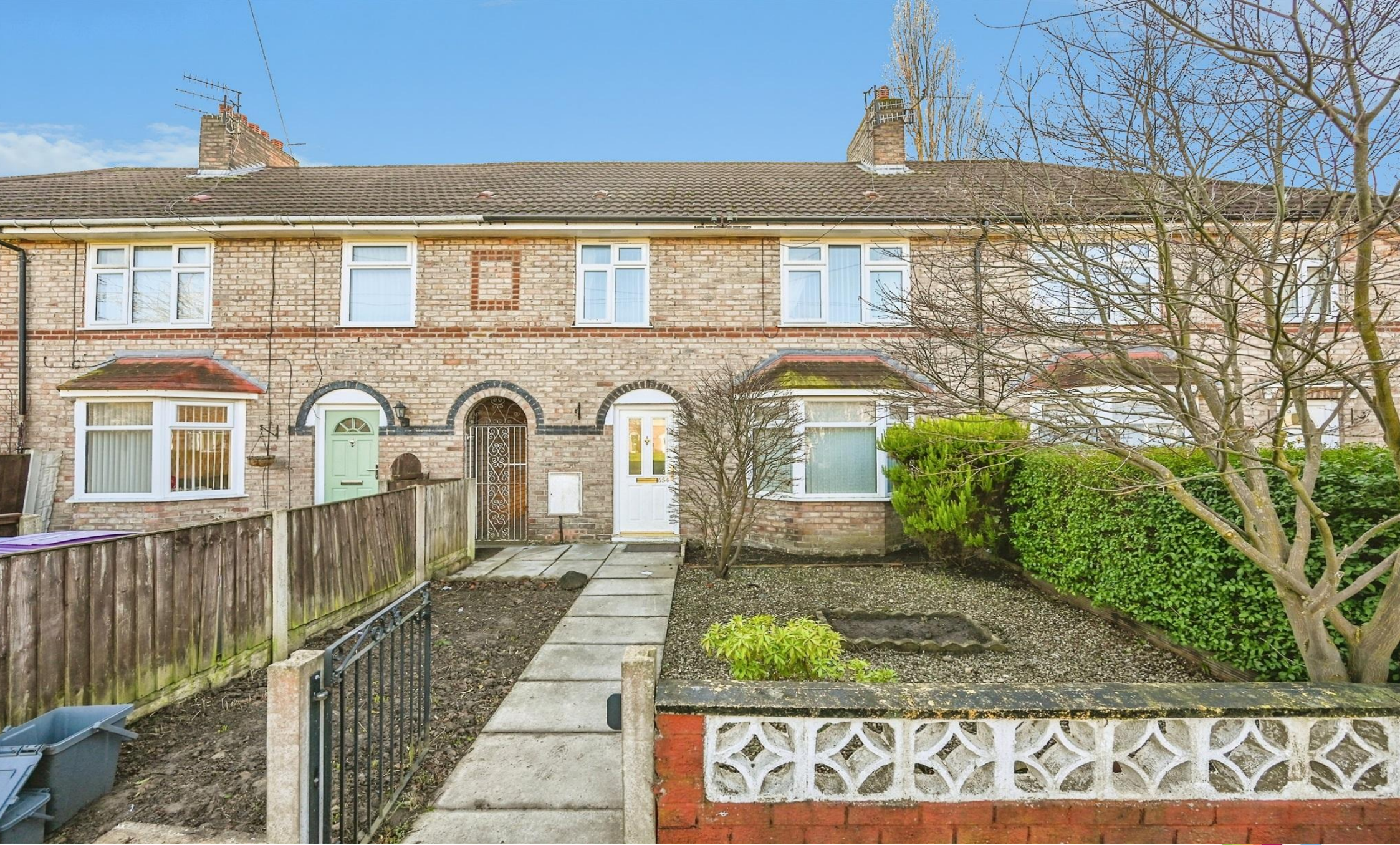
Mather Avenue, Liverpool L19 4TQ