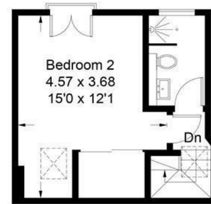
Room In Roof Sq ft 230