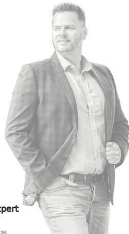
The Leamington Property Expert

Floor plan produced in accordance with RICS Property Measurement 2nd Edition, Incorporating International Property Measurement Standards (IPMS2 Residential). © nichecom 2026. Produced for Flyp Homes Limited. REF: 1430098