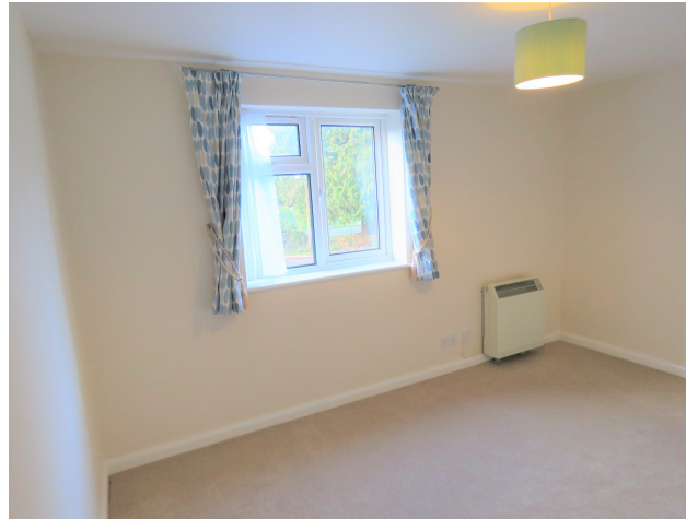
BEDROOM ONE electric heater.

ENTRANCE HALL entry phone system, storage cupboard and airing cupboard housing hot water cylinder, vinyl floor, electric heater.