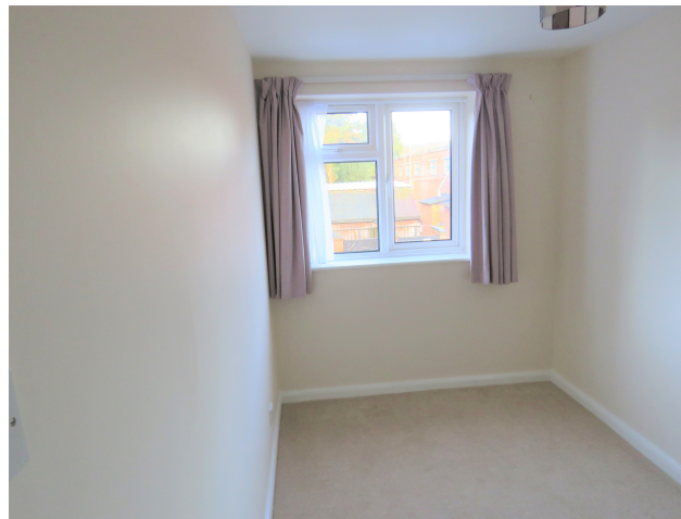
BEDROOM TWO electric heater.