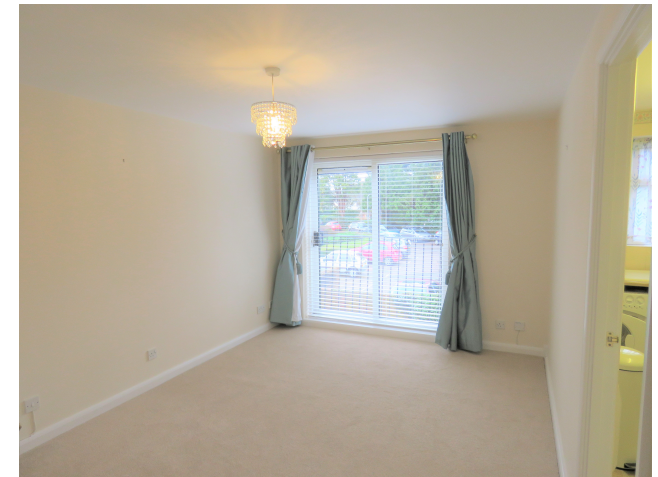
LIVING ROOM double glazed, double doors with Juliet balcony, electric heater and door to: