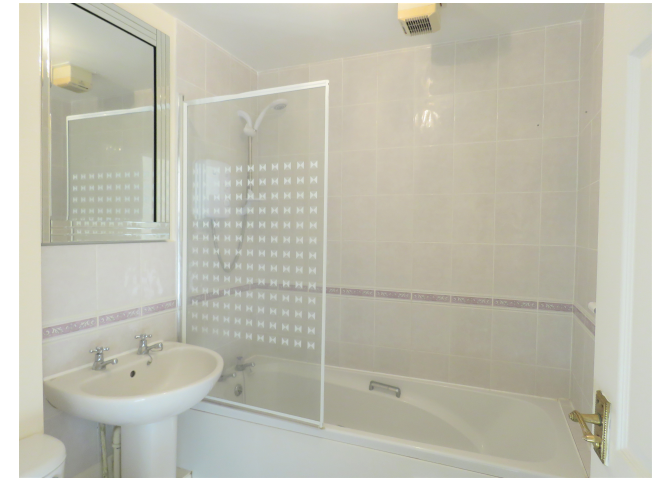
BATHROOM with white suite of low level WC pedestal basin, bath with shower screen and Triton shower unit, extractor fan, vinyl floor, heated towel rail.