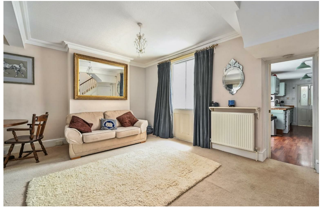
Russell Square, BN1 Approximate Gross Internal Area = 93.9 sq m / 1011 sq ft