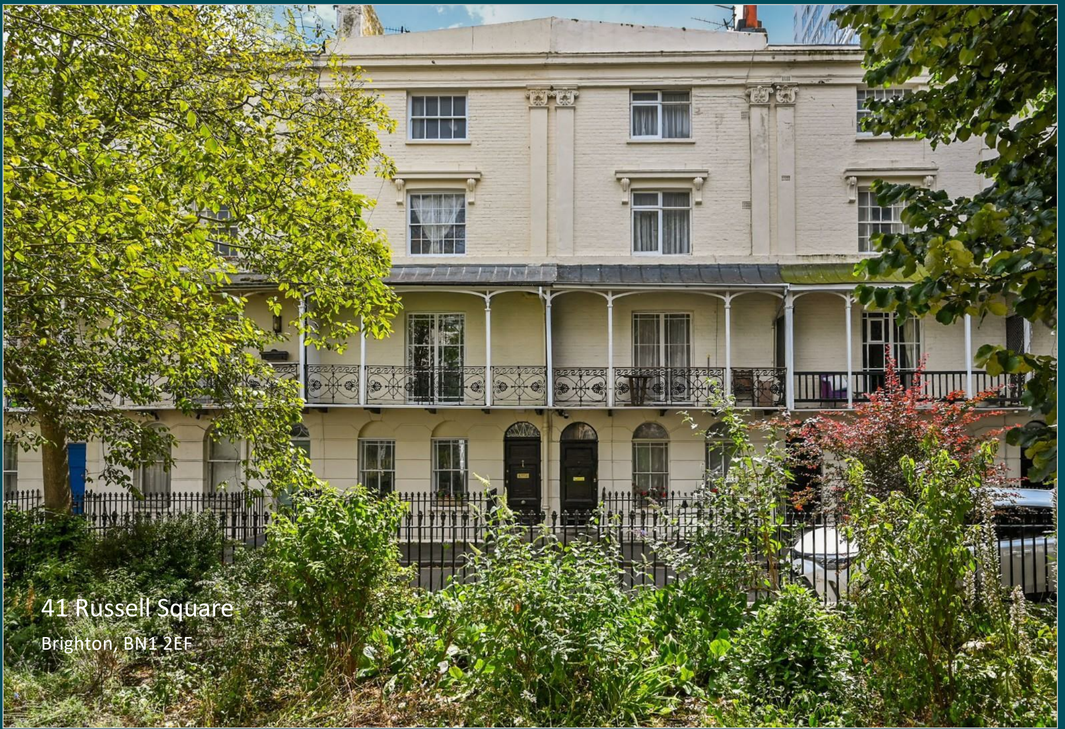
41 Russell Square Brighton, BN1 2EF