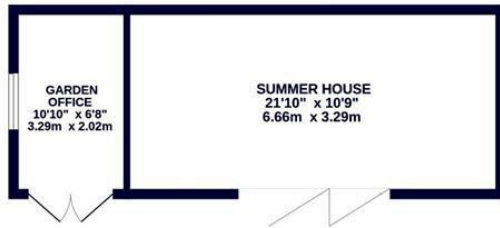
OUTBUILDING 307 sq.ft. (28.5 sq.m.) approx.