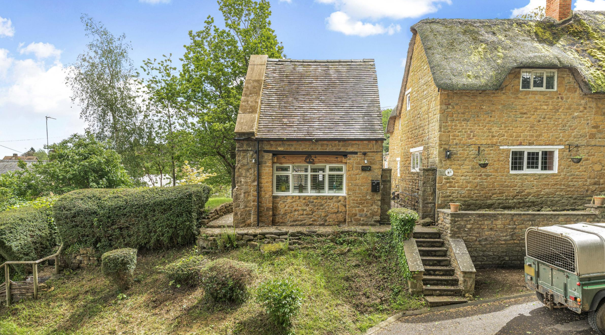
Enchanted Cottage, Back Hill Shotteswell, Banbury, Oxon, OX17 1HU