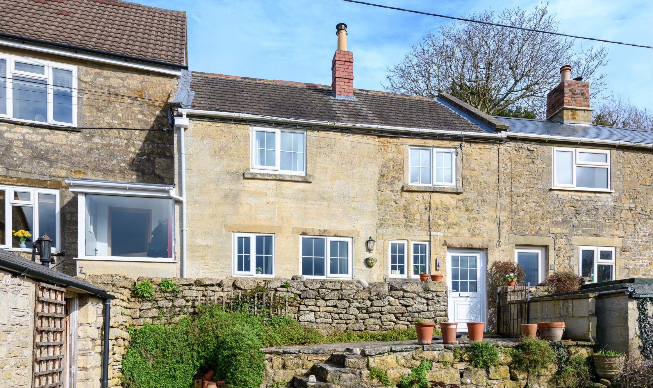
4 Staples Hill Freshford, Bath, Bath And North East Somerset, BA2 7WL