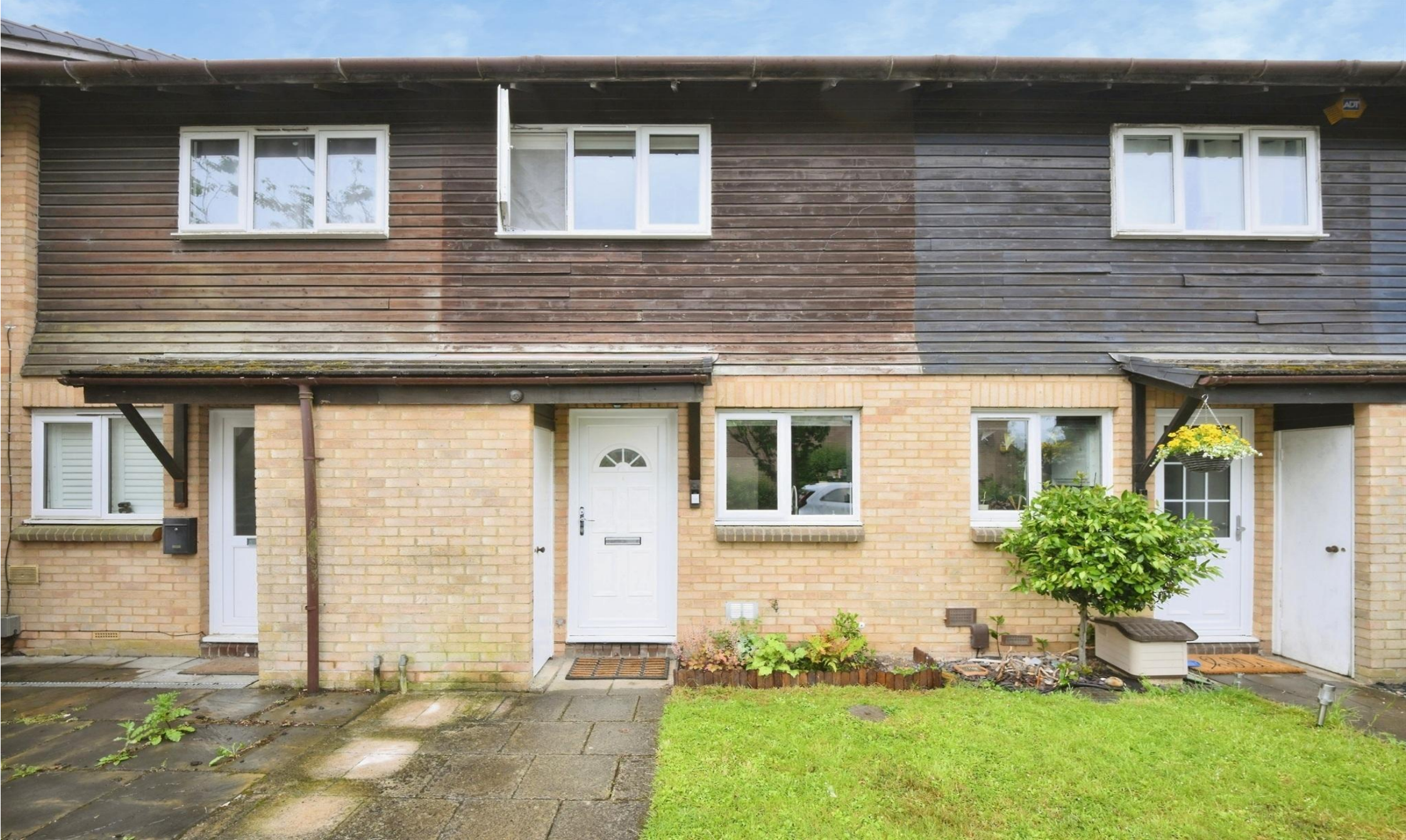
Ramblers Way, Welwyn Garden City AL7 2JU