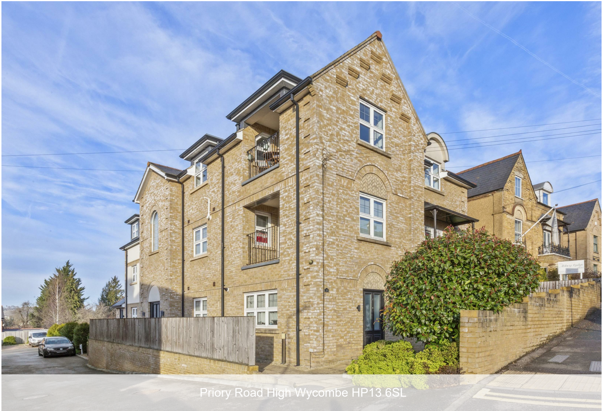
Priory Road High Wycombe HP13 6SL