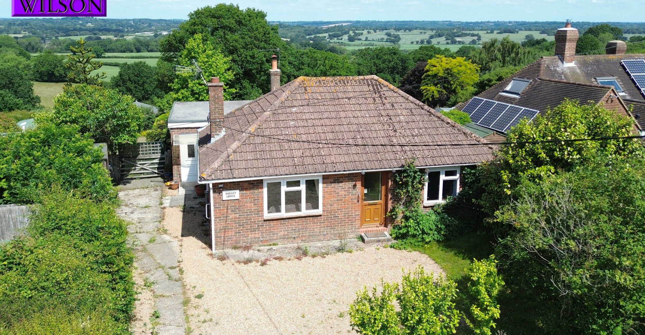
Midget Lodge, Dixter Lane, Northiam, East Sussex TN31 6PP. £525,000 OIEO Freehold