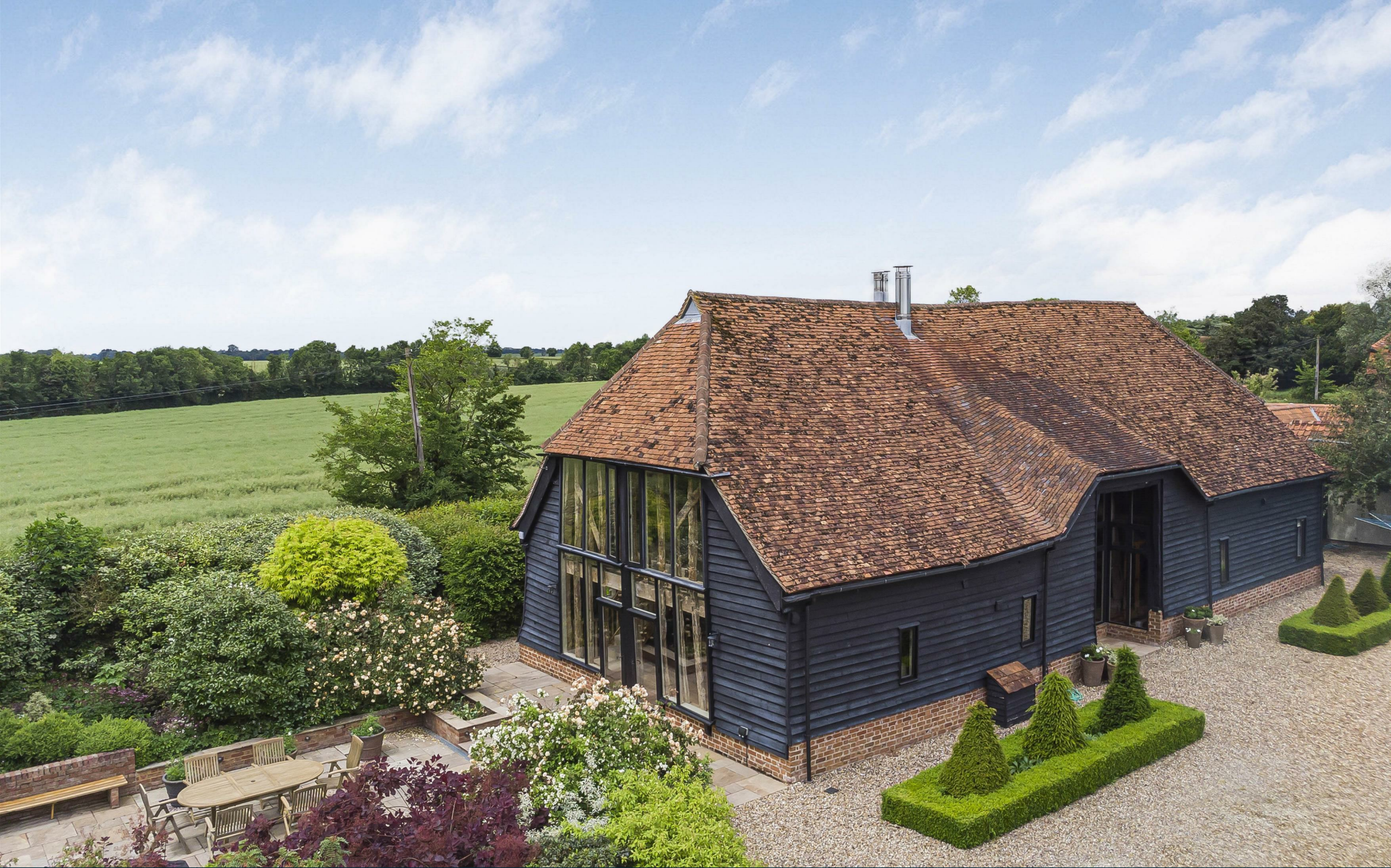
Midsummer Barn, Boyton End, Stoke By Clare, CO10 8TB