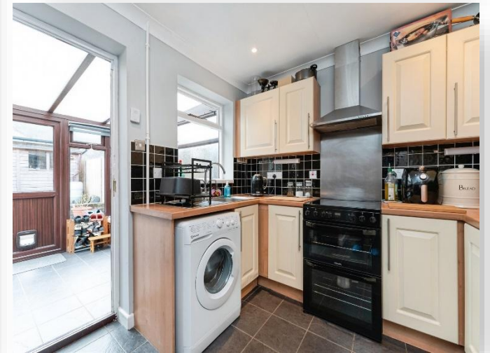
Rowan Drive, Brandon, IP27 0HJ