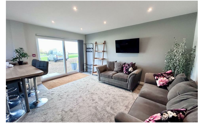
▼ Ground Floor