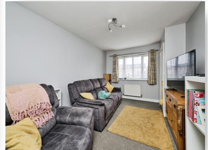
Copperfields, Wisbech PE13 2HJ