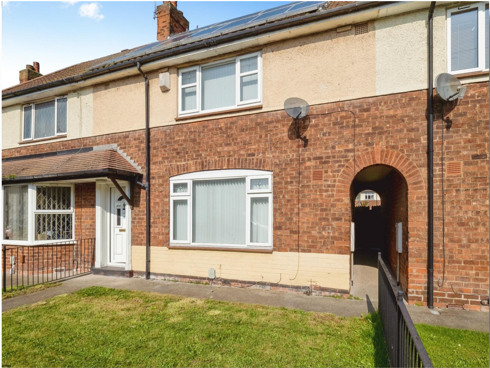
Tanfield Grove, Hull, HU9 4PL