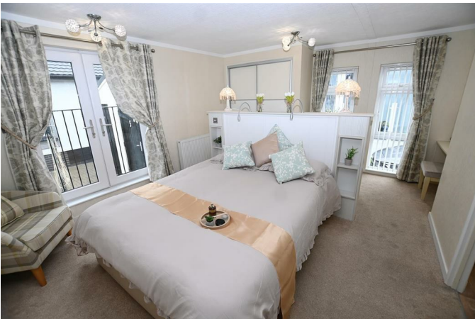
Bedroom One 14'9 x 11'7 (4.50m x 3.53m)

Juliette style UPVC double-glazed French Doors to the rear elevation, further UPVC double-glazed window to the side elevation, radiator, power points, range of fitted wardrobes to one end with a dressing area and make-up table, panelled door leading to the en-suite.