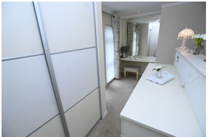
En-Suite 12'7 x 7' (3.84m x 2.13m)

Juliette style UPVC double-glazed French Doors to the rear elevation, further UPVC double-glazed window to the side elevation, radiator, power points, range of fitted wardrobes to one end with a dressing area and make-up table, panelled door leading to the en-suite.