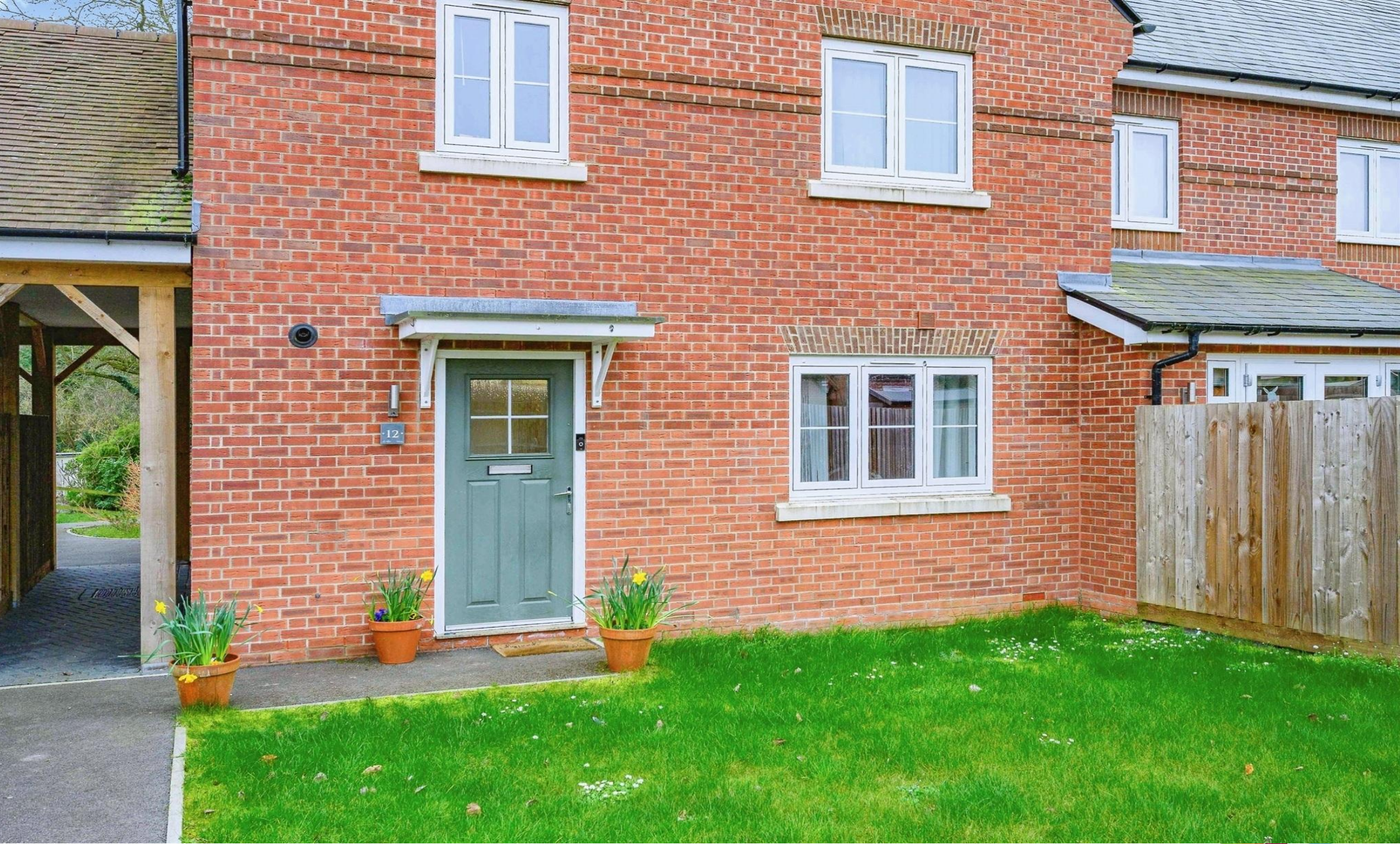
Heron Mews, Hemel Hempstead HP1 2EG