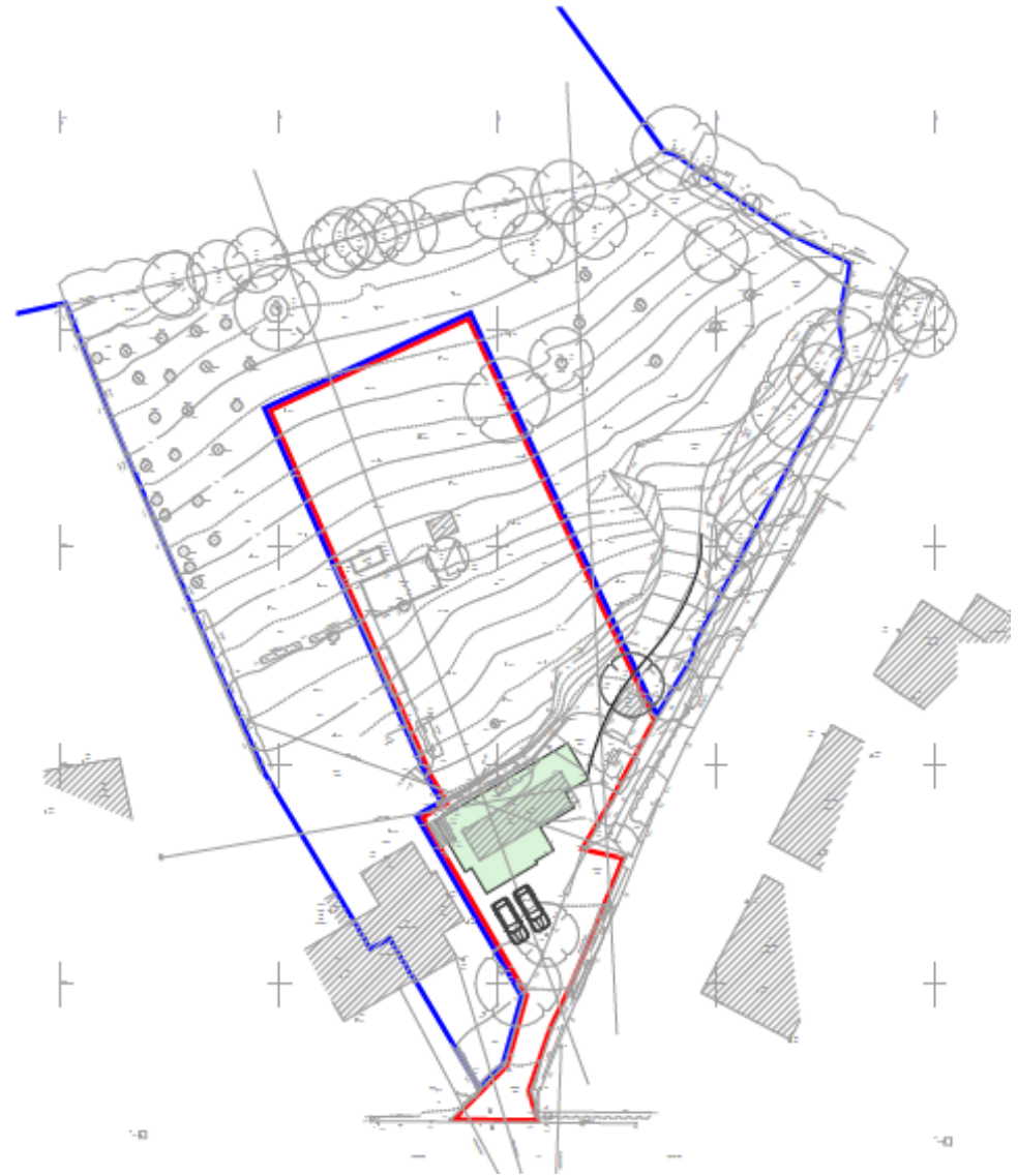
Proposed Residential Dwelling