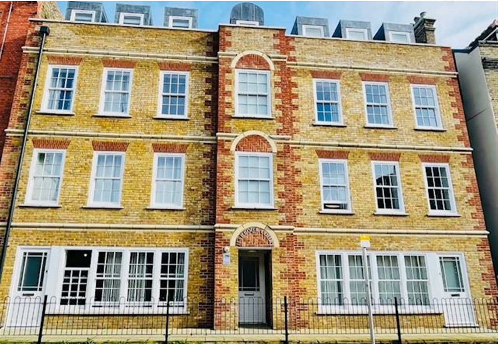
Harbour Court High Street, Ramsgate, CT11 9RJ