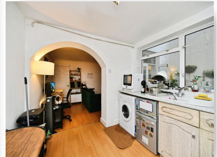
Hastings Road, Brighton BN2 3AF