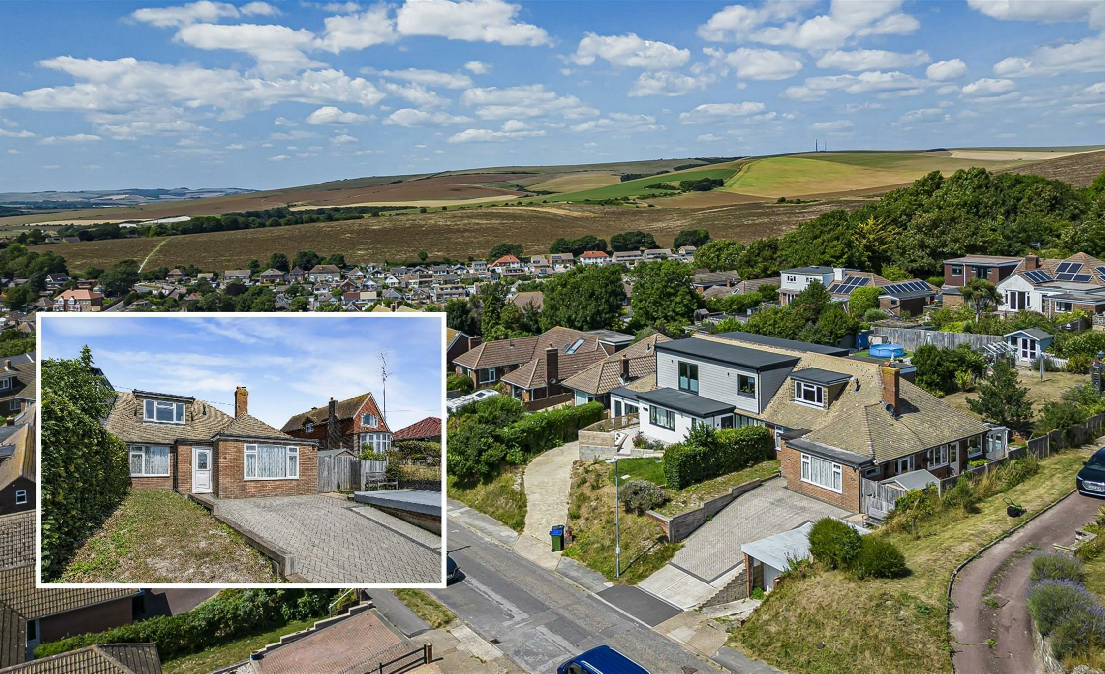
30 Seaview Road, Denton, BN9 0NP