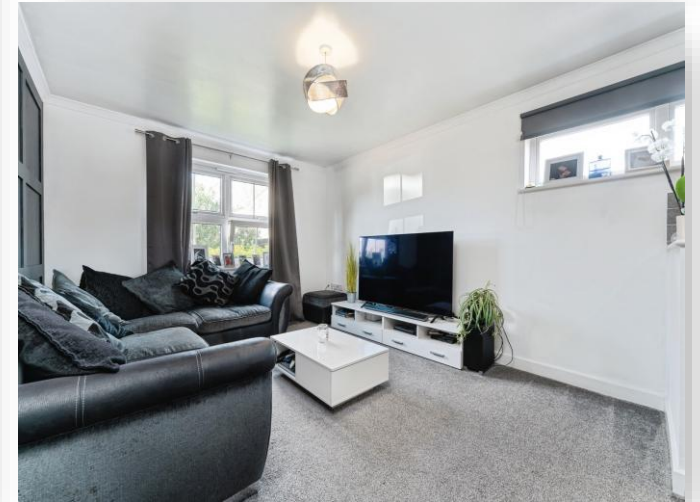
Florence House, Main Street, Witchford CB6 2HP