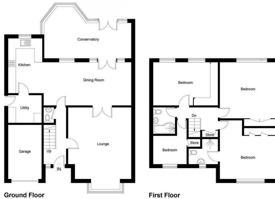
Illustration for identification purposes only, measurements are approximate, not to scale. (ID629785)