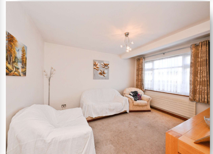
Grenville Avenue, Broxbourne EN10 7DH