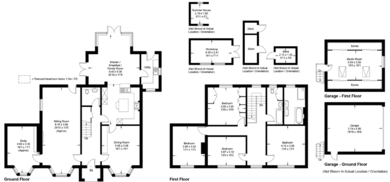
Illustration for identification purposes only, measurements are approximate, not to scale. Imageplansurveys @ 2025

A buyer is advised to obtain verification from the solicitor.